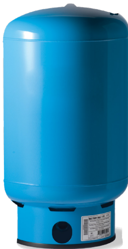
Domestic RO Storage Tank

Ideal for use with a reverse osmosis system, the storage tank structure is constructed of high-quality cold rolled steel designed to last for decades. The NSF-approved inner water chamber is perfect for storing product water without compromising on taste. With an adjustable tank pre-charge, you'll always have the right water pressure for your equipment.