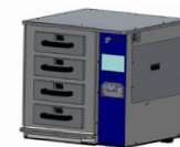
IS-4000 4- DRAWER STEAMER