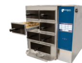
IS-7000 7- DRAWER STEAMER