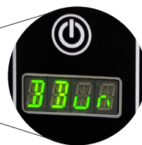
Best Burger Bun