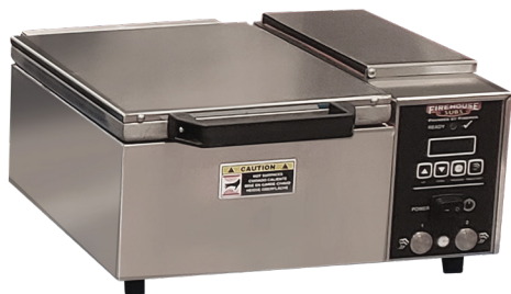
Deluxe Food Warmer DFW-150

The Deluxe Food Warmer instantly creates steam with the simple push of a button. Producing a consistent amount of steam, the Deluxe Food Warmer removes the guesswork, delivering a uniform finished product from one operator the next.