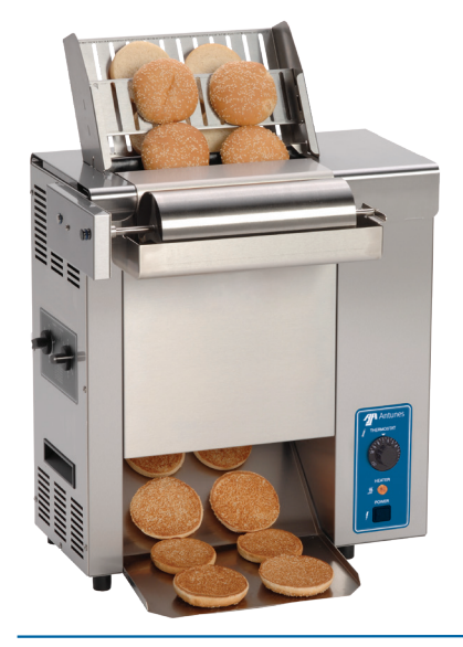
VCT-1000 Vertical Contact Toaster

The Vertical Contact Toaster gives buns a consistent, golden brown finish which helps the sandwich stay firm and delicious. The VCT-1000 has a preset features a dial thermostat for adjusting the quality of the toast for a variety of different bread products. Available preset toast times range from 10 seconds to 28 seconds to keep up with the demand of any sized operation.