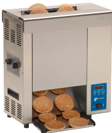
VCT-2000 Vertical Contact Toaster

The Vertical Contact Toaster gives buns a consistent, golden brown finish which helps the sandwich stay firm and delicious. Additional products for the unit include a wide mouth bun feeder, motorized butter wheel, heated base, and back plate. The VCT-2000 features a digital controller for making precise adjustments to the quality of the toast for different bread products.