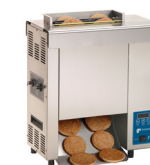
VCT-2000 with Wide Mouth

*Toast time will vary 20% depending on power frequency