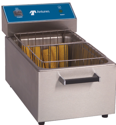
CCC--20 Corn Cooker

Make every meal feel home cooked by serving it with a perfectly fresh ear of corn. The Corn Cooker uses a preset cooking time and low temperature heater to ensure the corn on the cob consistently looks, tastes, and smells fresh for up to five hours.