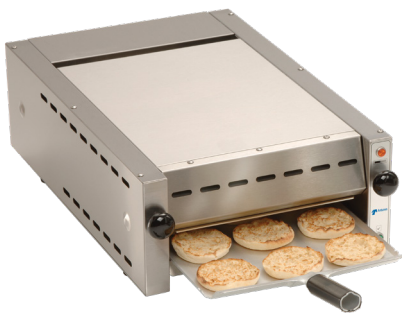
MT-12 Muffin Toaster

The partial load switch and energy conservation mode for idle periods allow operations to toast muffins on demand easily throughout the day.