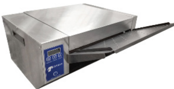
GSTT-1H Gold Standard Tortilla Toaster

This unit features a motorized conveyor that guides product along the two high-temperature platens. With a front load and front return, the Gold Standard Tortilla Toaster easily fits into any kitchen configuration. The GSTT-1H utilizes a digital controller, allowing operators to quickly adjust the temperature and motor speed to ensure products are cooked to their exact specifications.